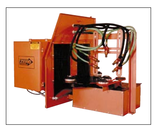
A-300 Automation Kit

The A-250 kit includes a variable-speed rotating fixture and one rack-mounted automatic blast gun. This simple automation accessory can be installed in almost any cabinet and removed when not needed. Perfect for short runs and sample processing.