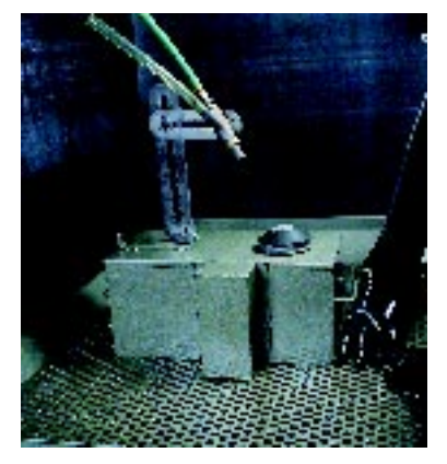
A-250 Automation Kit