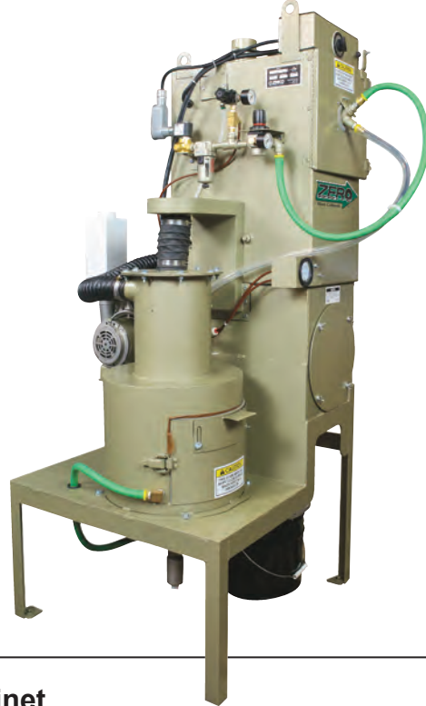
BNP-160 with reclaimer and dust collector

Small Capacity Tumble Basket for Production Jobs