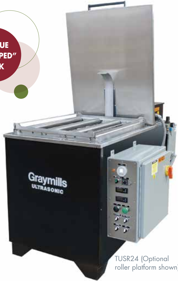
TUSR24 (Optional roller platform shown)